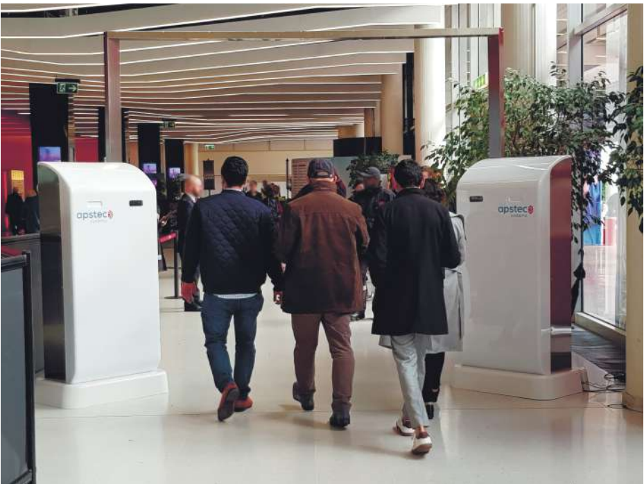
State-of-the-art mass people screening technology for crowded places